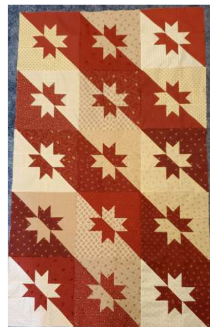
Salt and Pepper!